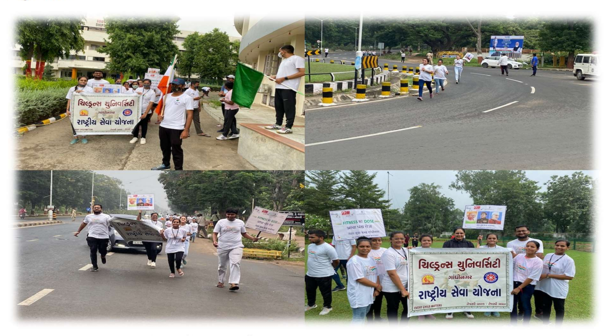
Fit India Freedom Run 2.0

Children's University, Gandhinagar N.S.S. A tree plantation program was organized in the university premises as part of the celebration of Amrit Mohotsav of Azadi by the unit.