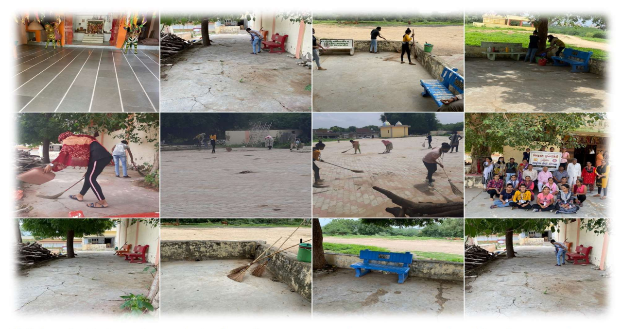
Children's University n. S. A cleanliness campaign was organized in the premises of Ramdevpir temple and its surrounding area at S, Unit and Borij village.